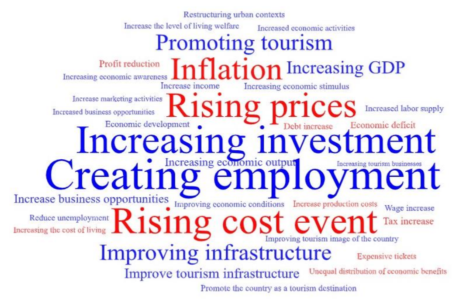
Figure 1. Economic impacts of sports mega-events.