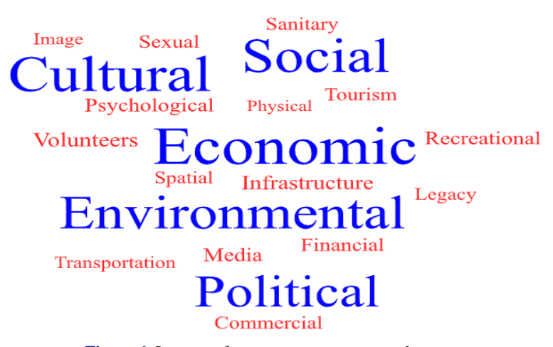
Figure 6. Impacts of sports mega-events at a glance.

On the other hand, some negative and positive effects are inevitably caused by these events that researchers should seriously focus on. Some positive effects perceived as seemingly significant but received less attention are volunteer-related, spatial, recreational, and leisure-related positive ones. Also, some adverse effects have been neglected, such as sexual, mental, financial, transportation, and infrastructure-driven. These mentioned above, positive and negative effects have been identified as the literature gaps.