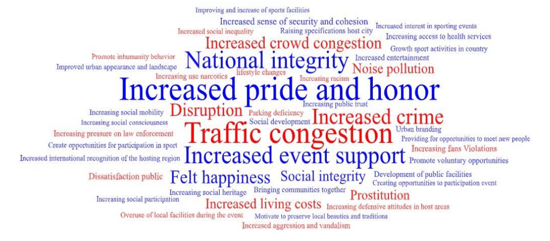
Figure 2. Social impacts of sports mega-events.